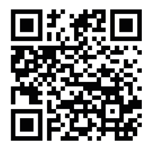
Scan QR Code for more information