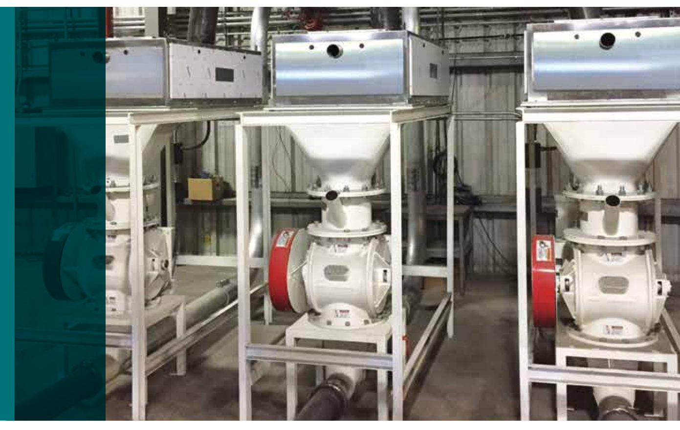
Schenck Process is committed to making your process work with the highest quality airlocks and valves. Whether you need an airlock with a wear resistant coating or a rebuilt valve, we will provide the equipment that meets your specific application requirements.