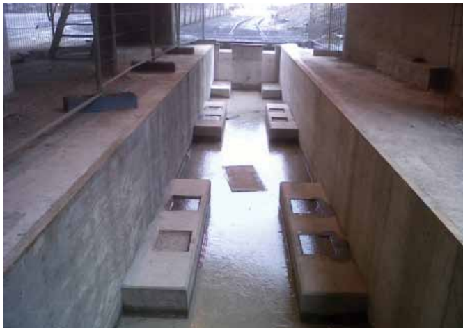
Weigh bridge pit with location platforms for load cells

Filling of the trucks would be by the existing outlet spouts. This allowed the operator to select between each weigh bridge as to which type of rail car was to be filled. The system would automatically tare each rail car arrival on the weighbridge and provide a tare weight record. Upon the preset full set point being reached during filling, a signal to stop filling would be given and the feed supply would stop. After a short time delay to allow for any in flight material and settling of material in the rail car, a final gross weight would be recorded. The operator would then have the facility to print out the individual weight records or a total weight of the train on completion of the filling of all the rail cars.