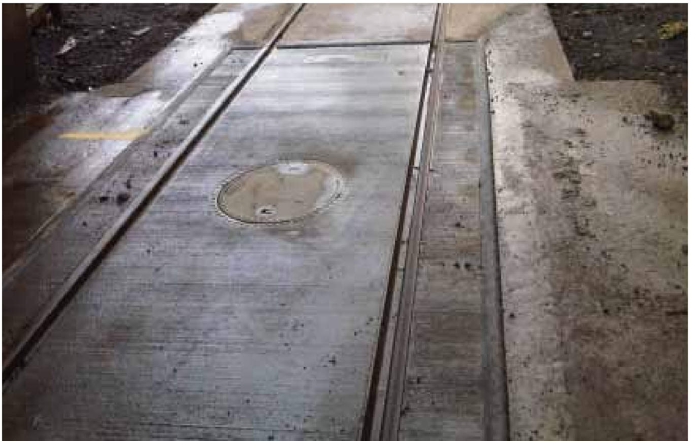
Completed installation of new rail weigh bridge

The final system design was for the supply of three in-ground weigh platforms, measuring 5m x 3m and 6m x 3m and 5m x 3m. Each platform was fitted with 4 load cells per platform, giving an overall length of 16 meters and was controlled and monitored using the Schenck Process Disobox and Disomat system controller. These units enable the facility to switch between each platforms and measure individual weight measurement or the total weight.