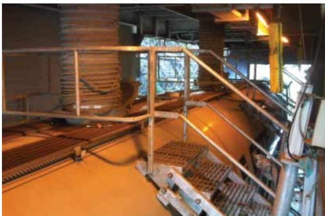
Tanker fill train loading station

Another consideration that the design team had to overcome was the low head room under the twin silos and how the 8 tonne platforms could be manoeuvred and installed safely into position above the pre-constructed in ground pit. RMB Contractors were commissioned to construct the concrete pit which the platforms would be lowered into as they provided a full design and build package. John Snowdon,